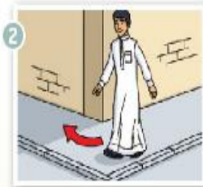
He walked _____ the corner.