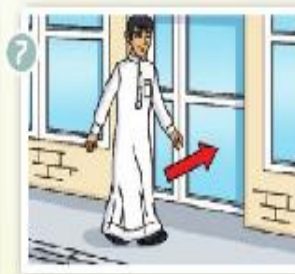
He went _____ the shop to buy a present.