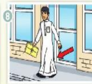
He came _____ the shop carrying a parcel.