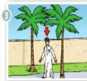
Then he walked _____ the trees.