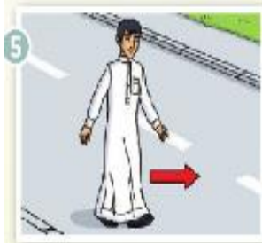
Then he went _____ the busy road.