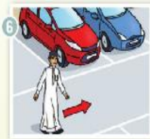
He walked carefully _____ the car park.